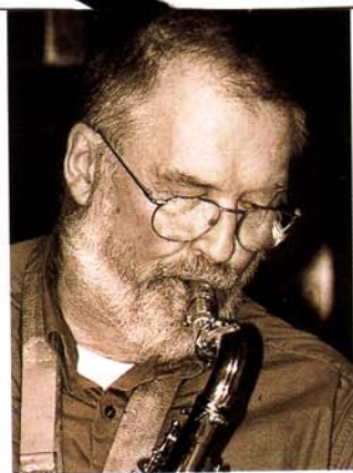
Jazz at the Carcosa Seri Negara.

This dinner show is priced at RM185nett per person. After KL performances, the group travels to Andaman Datai Bay in Langkawi for September 10 show. Tel: 2282 1888